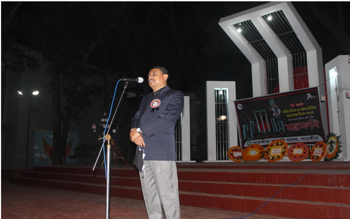
International Mother Language Day Celebration