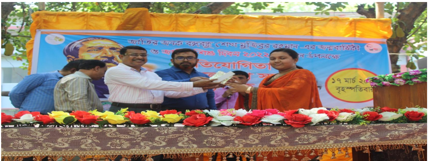
17 March Celebration