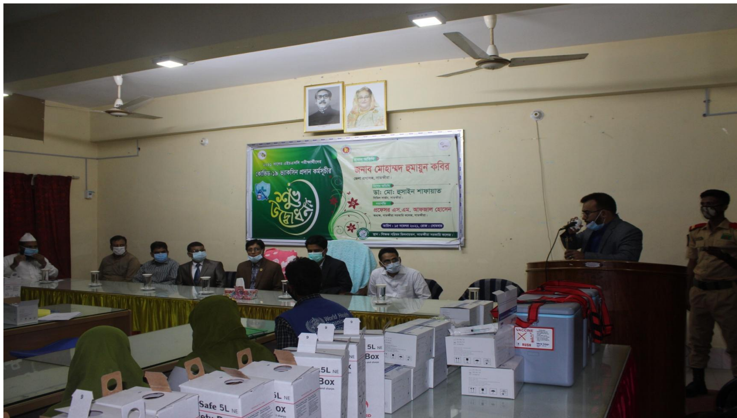
COVID-19 Vaccination Program