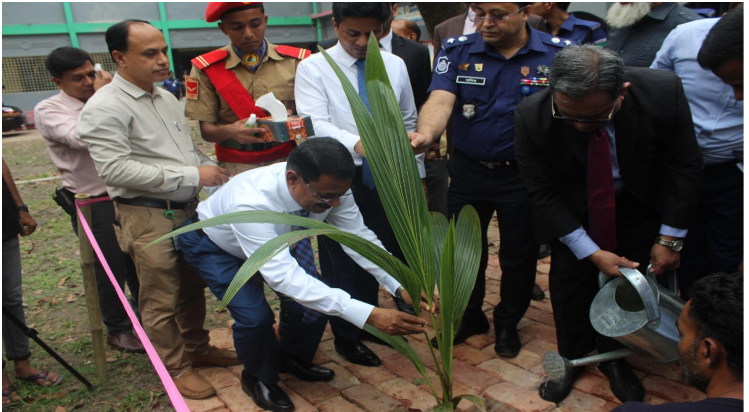
Tree Plantation by honorable Chief Justice in the campus