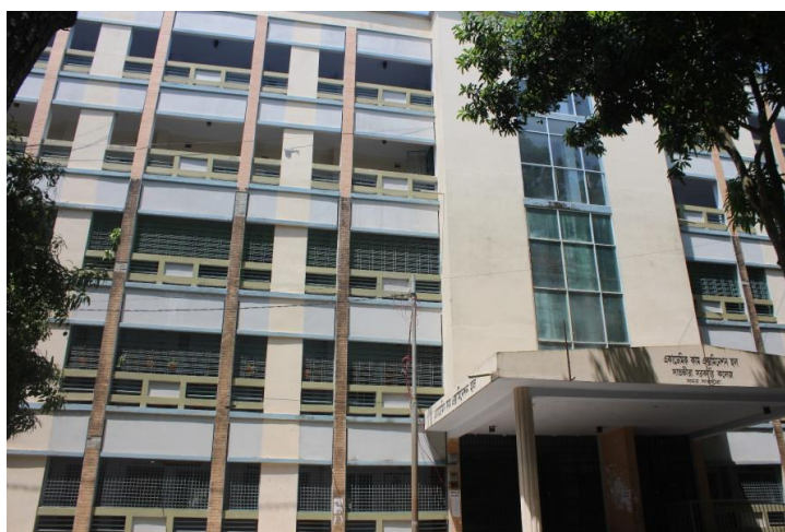
Academic Cum-Examination Hall