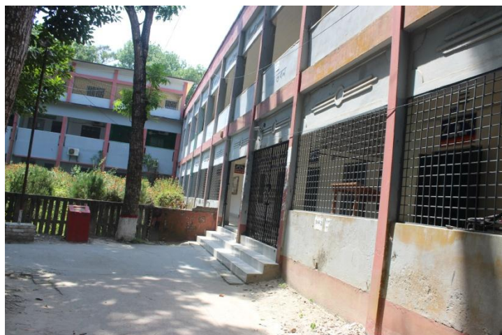
Arts Building -1