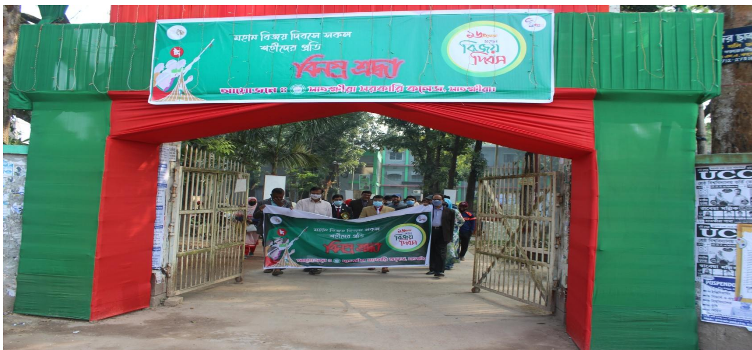
Victory Day Observation