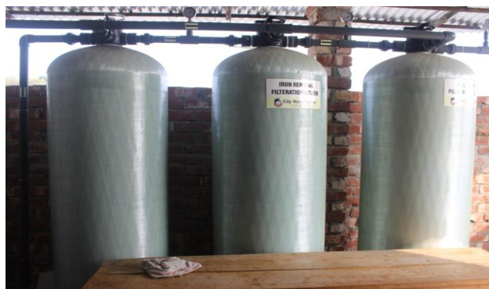
Water Treatment Plant (Financed by CEDP)