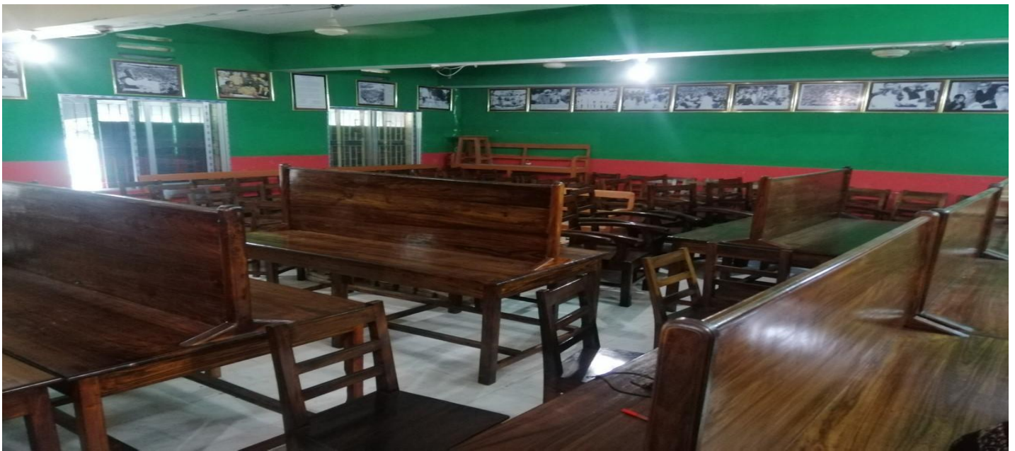
Reading Room of the College central Library Financed by CEDP