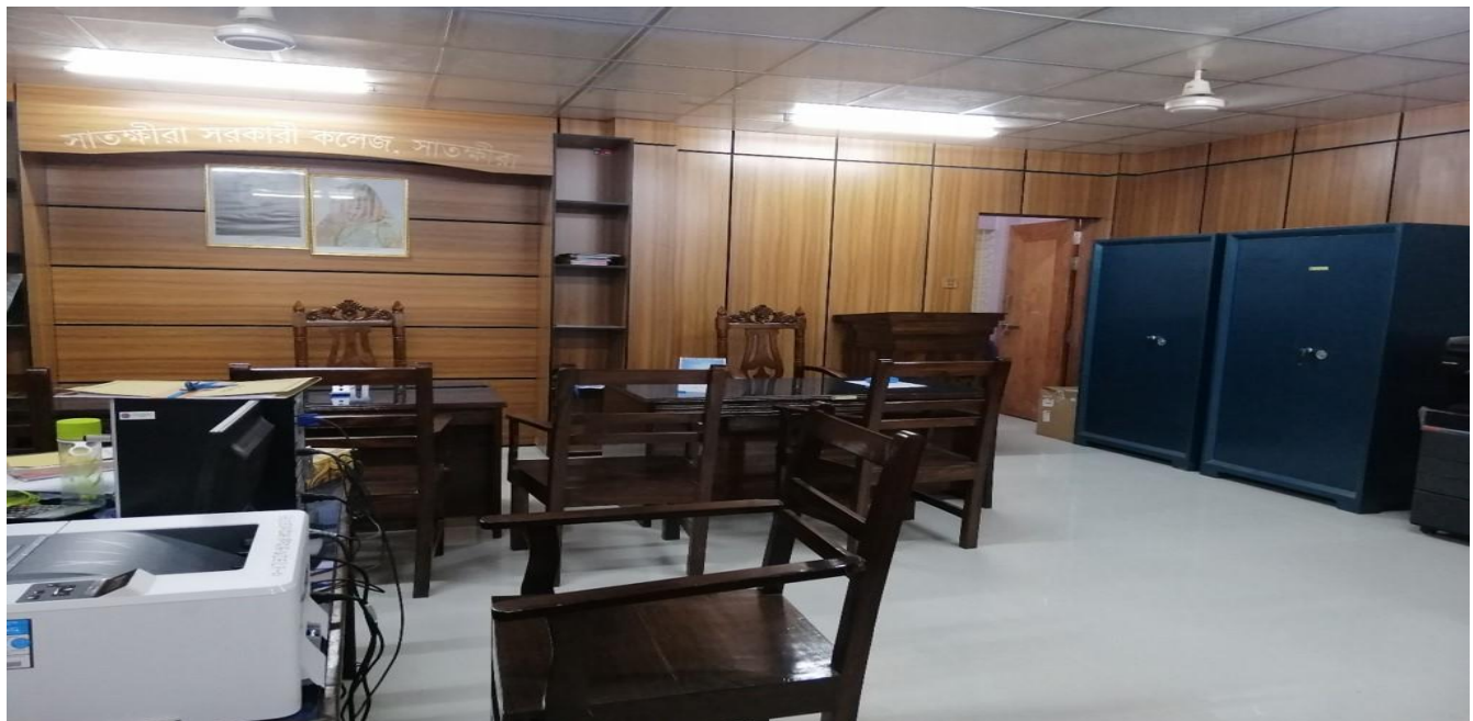
Office Room of IDG-CEDP, Satkhira Govt. College, Satkhira.