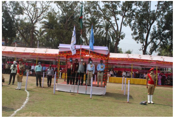
Annual Sports Day