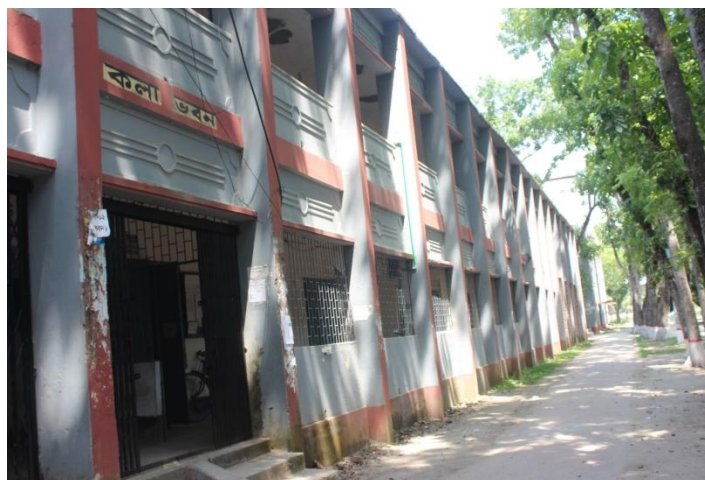
Arts Building -2