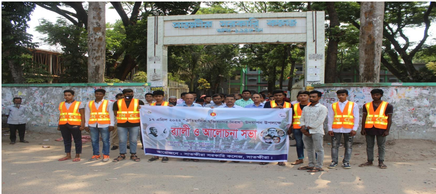
17 April 'Mujib Nagar Day' Celebration