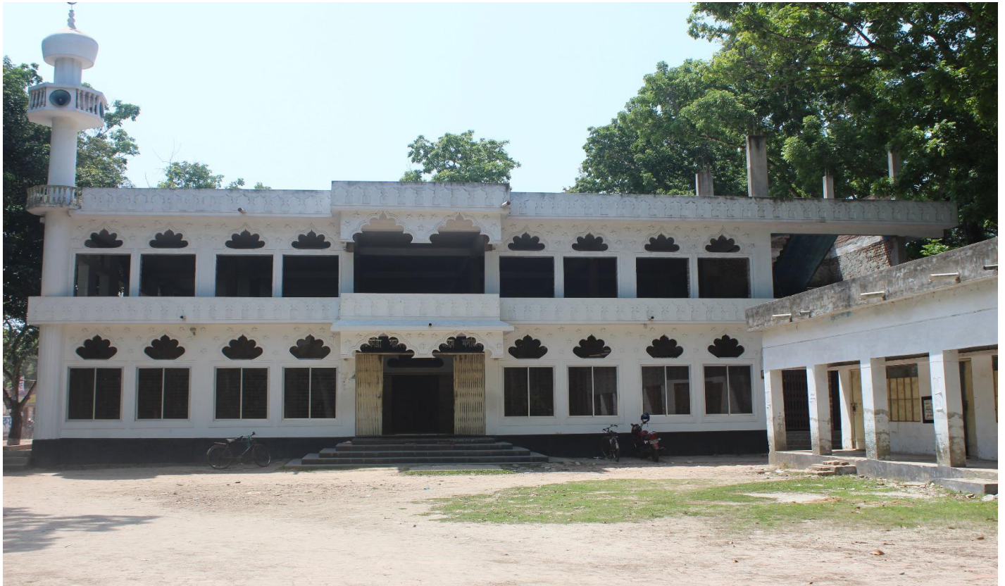
College Jam-e Mosque