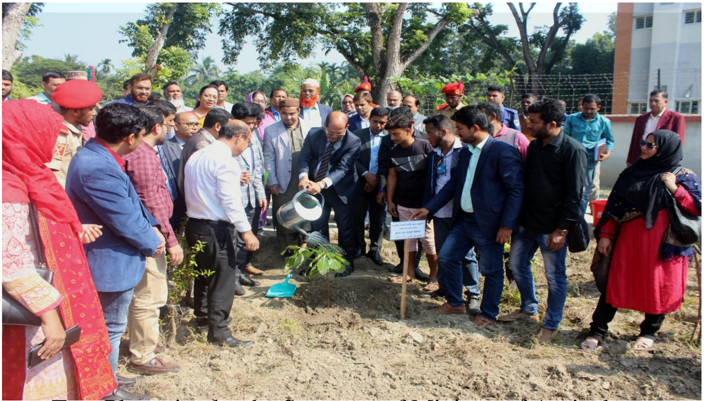
Tree Plantation by the Secretary of Ministry of Agriculture