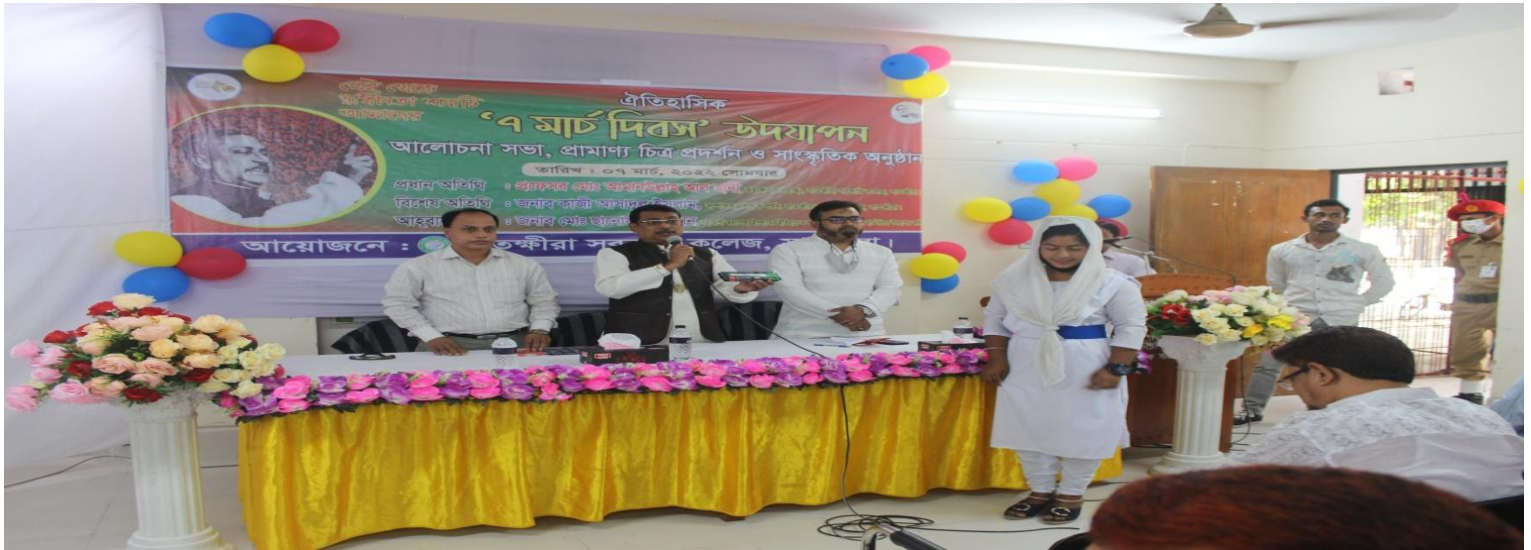
7 March Celebration