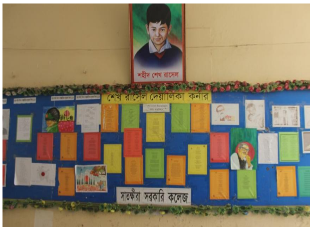
Sheikh Rassel Corner