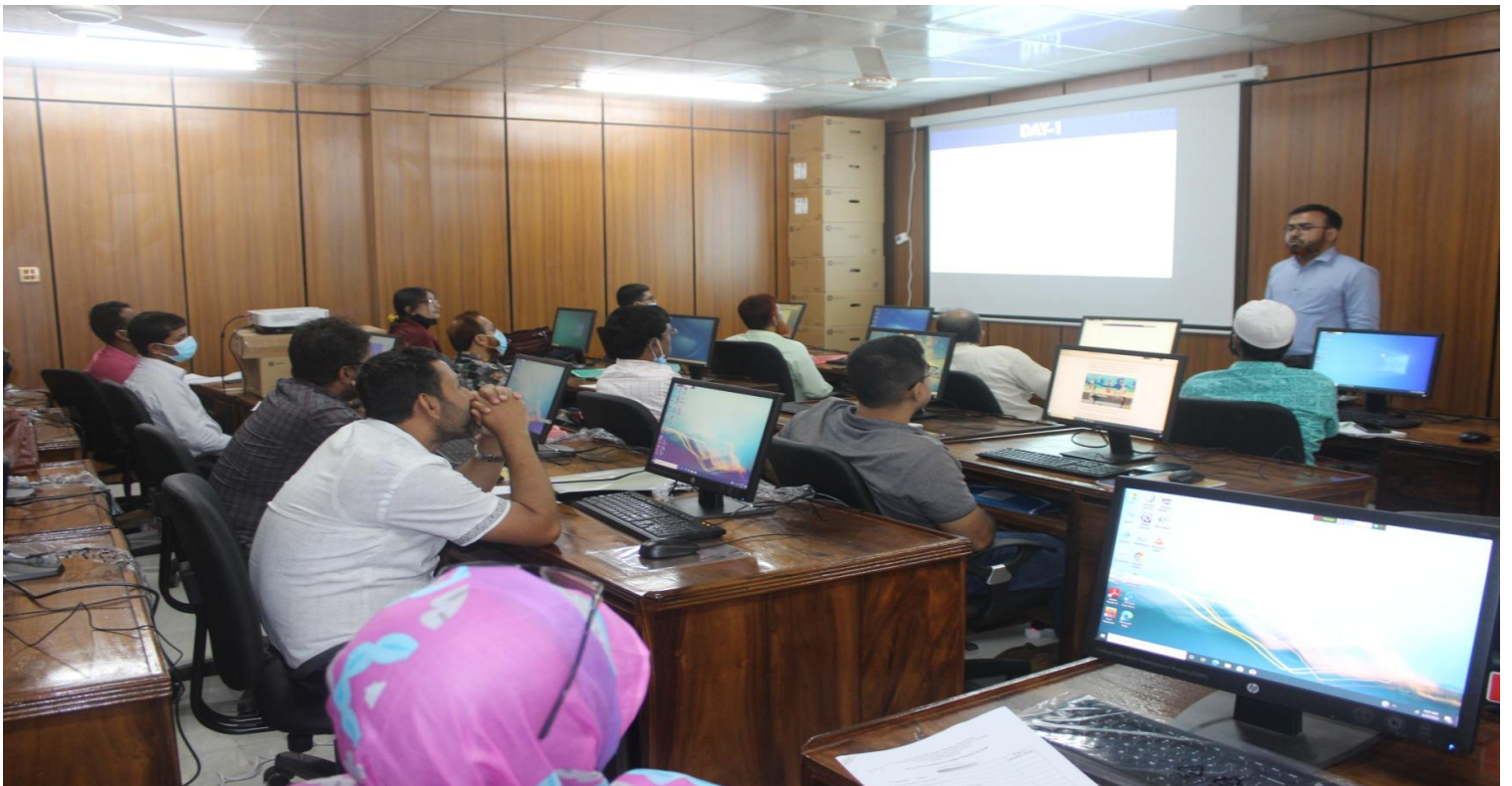
Multifunctional Computer Lab Financed by CEDP