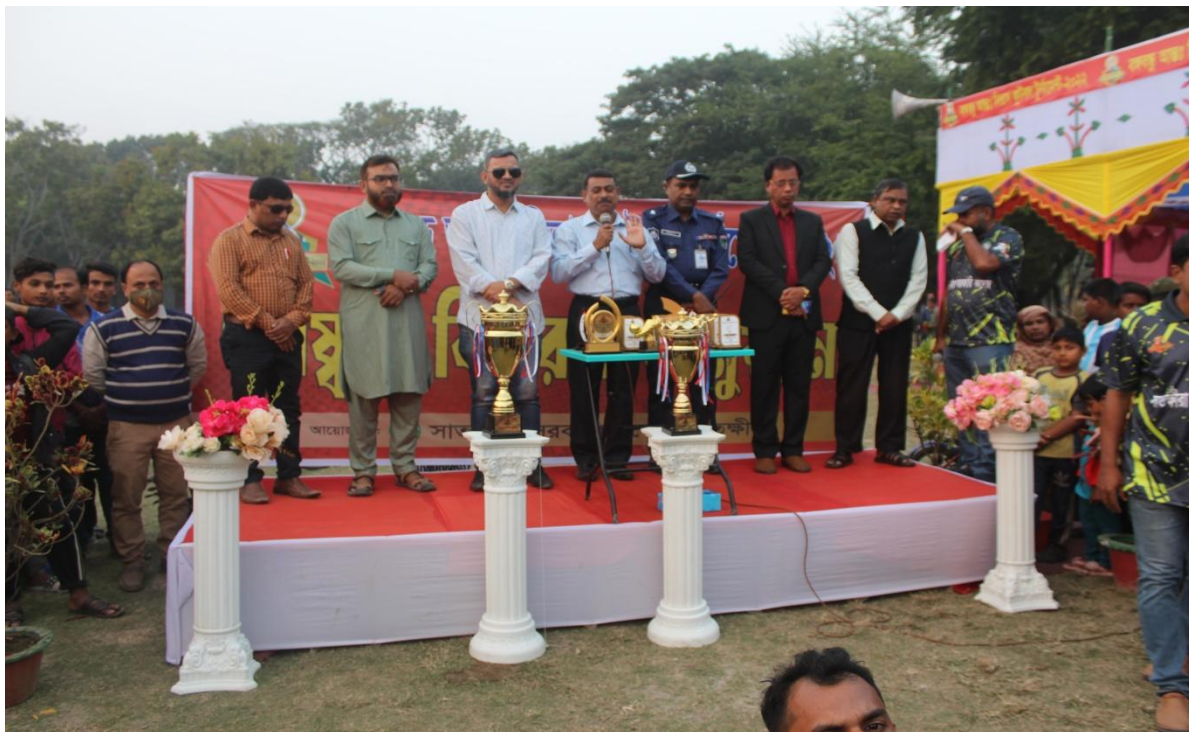
Closing of Bangabondhu Inter Department Football Tournament