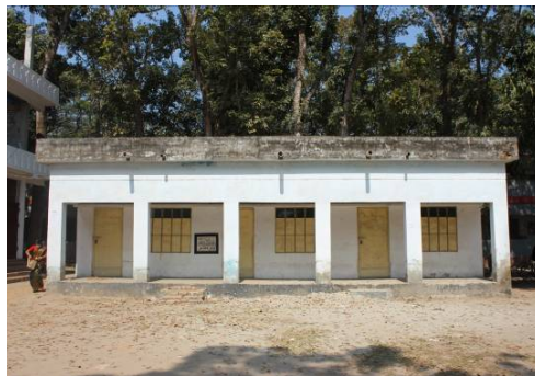
Imam Rest House