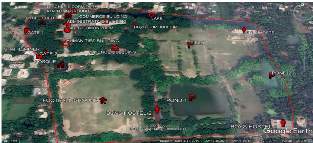
Satkhira Govt. College Map